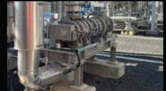
Catox booster, HP CO 2 Compressor

More and more energy companies around the world are seeing the benefits of Roots Systems' gas blower packages as they move towards their goal of achieving a 'net zero' carbon footprint.